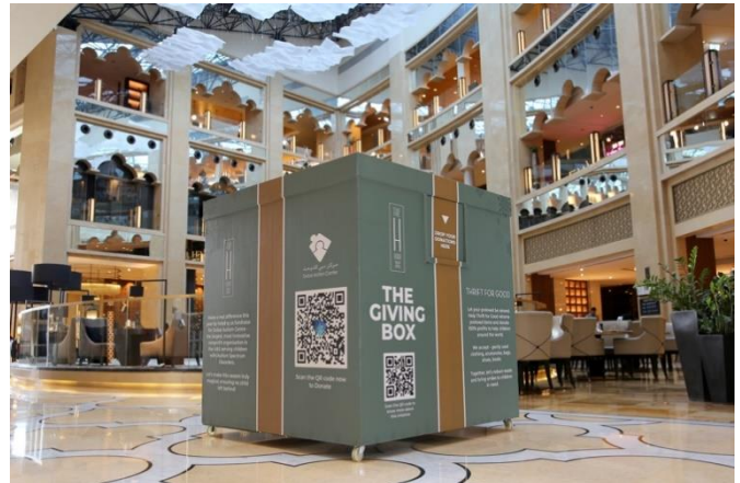
The Giving Box – Thrift for Good