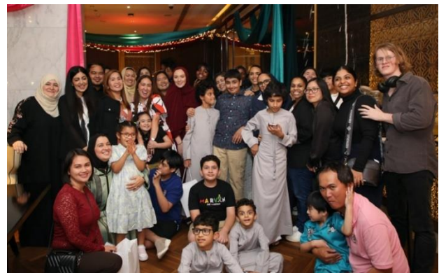
CSR Iftar for students and family of Dubai Autism Center & Georgetown