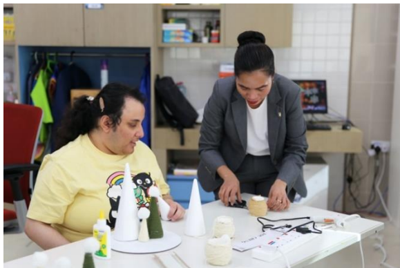
Craft workshops with Dubai Autism Center