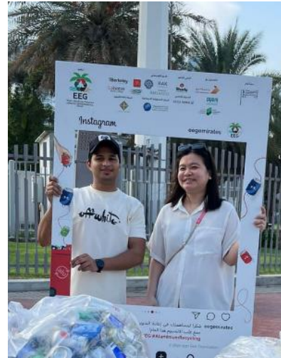
Can Collection Campaign