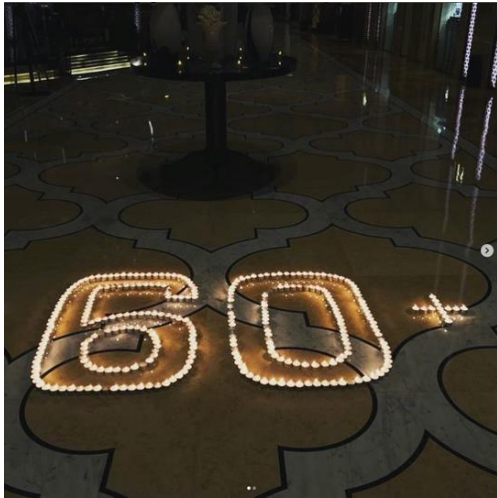
Earth Hour Celebration at The H Dubai